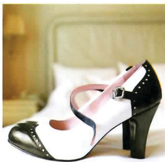
Favored by swing dancers, the bride's shoes (remixvintageshoes.com) were ultra-comfortable.