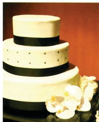
The black-and-white cake by Patina Catering had chocolate and lemon layers and, yes, plus signs etched into the icing.