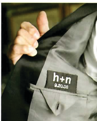
Groomsmen and the father of the bride had labels (initial-impressions.net) with the plus-sign motif sewn into their suits.