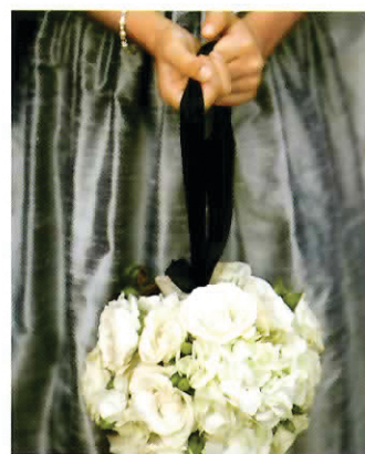
The flower girl wore a platinum silk dress (pegeen.com) and carried a pomander of roses, hydrangeas, and ranunculus.