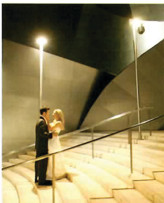
At the end of the night, the bride and groom slipped away for some quiet, enveloped by the dramatically lit building.