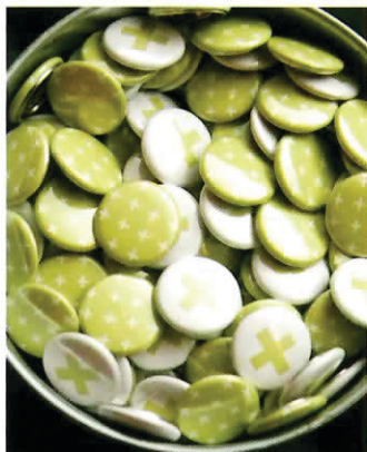
Using a button maker (americanbuttonmachines.com), the couple made pins with the plus sign for their guests.