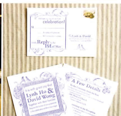
LEFT: Sugared anemones gave the cake a modern touch. ABOVE: The vertical gardens at SmogShoppe inspired the design of the invitations.