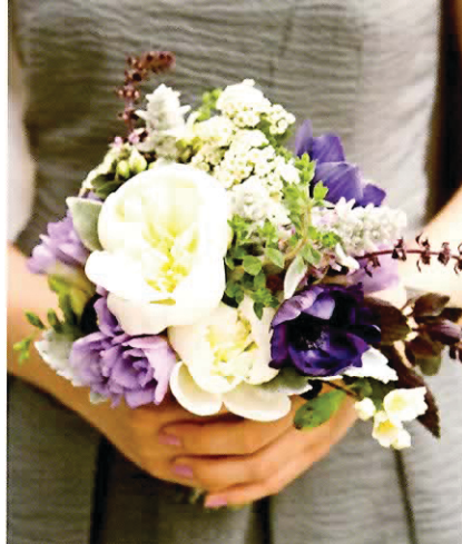
FAR LEFT: The couple took photos after the ceremony in a nearby park. LEFT: Lynh wanted a "just-picked" look for the bridesmaids' bouquets.